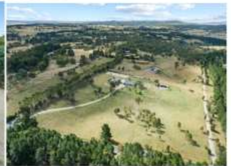
33 Lumley Rd Wamboin